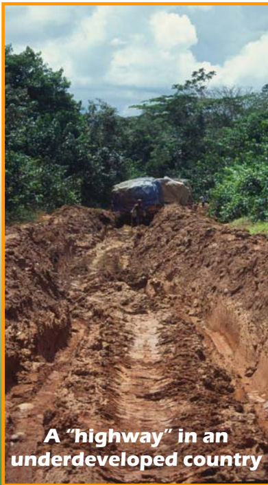
A "highway" in an underdeveloped country