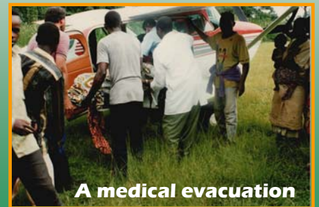
A medical evacuation

Many missionaries working in remote locations face the enormous obstacle of slow and unsafe transportation. Mission aviation daily saves lives and transports the gospel in places around the world that could not be reached any other way.