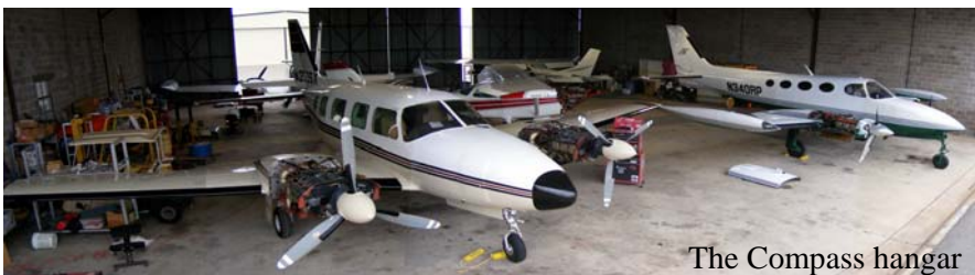
The Compass hangar